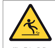
Slip, Trip, Falls