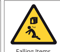
Falling Items from Above