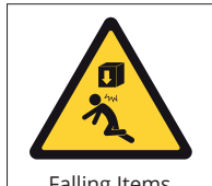
Falling Items from Above