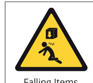
Falling Items from Above