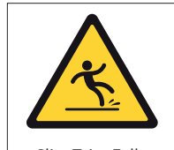
Slip, Trip, Falls